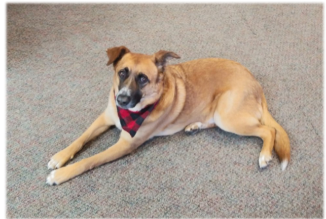
Caesar decided to take a well-earned break from peeling potatoes!